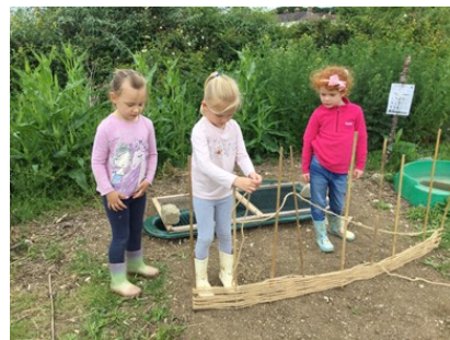
Forest school fun!