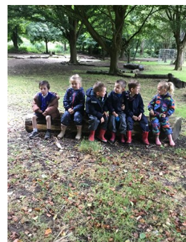
Year R visited Cobtree Park