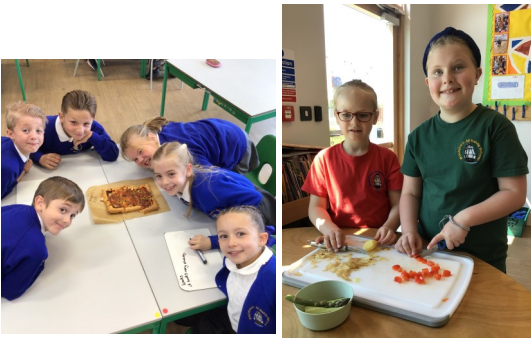
Year 3 tasted seasonal vegetables and used their peeling and chopping skills to make a seasonal tart.