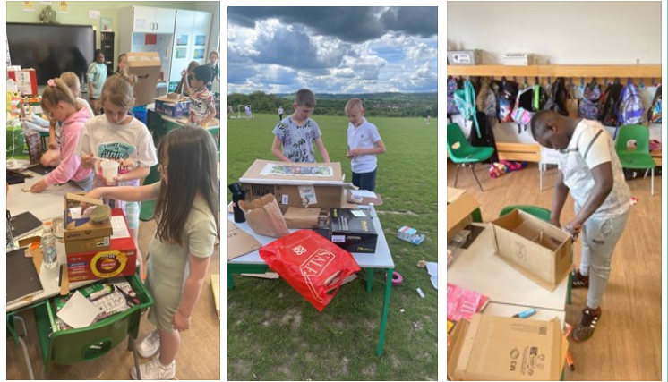
Raven Class designed and made their dream houses