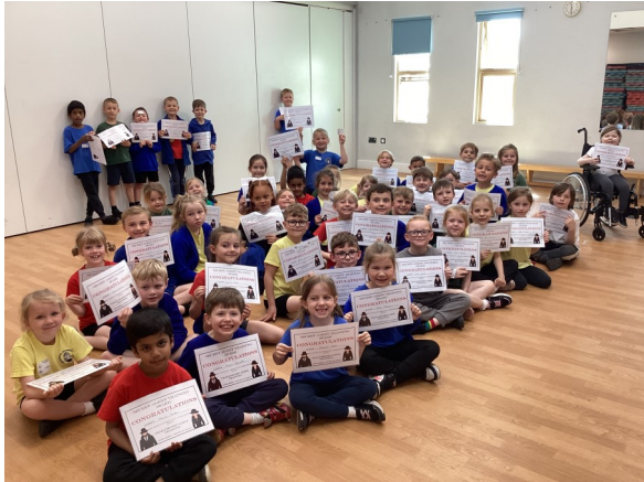
Our Year 2 Secret Agents graduated!