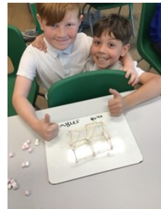
Year 4 had fun at the Science Observatory Centre