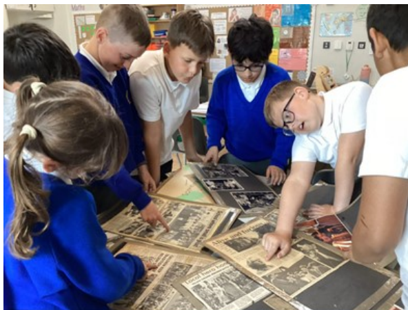
Jackdaw class researched the history of Wouldham